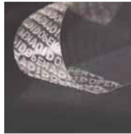
SK 6807 - Zero transfer