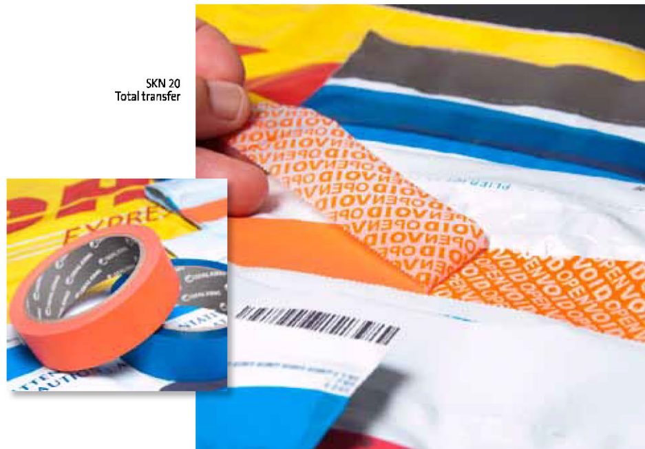
SKN 20 Total transfer

As a major worldwide supplier of tamper evident tapes to International Civil Aviation Organisation (ICAO) approved Security Tamper Evident Bags (STEB) manufactures, we offer a comprehensive list of high quality tamper evident tapes and films to meet your specific needs of transporting cash, documents and valuables. These tapes provide practical security solutions to various industries and market sectors such as finance and banking, airlines, cash handling, logistics and courier services.