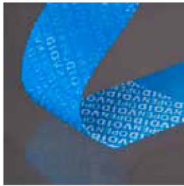
SK 88 - Zero transfer