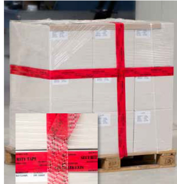
SK 77 - Total transfer