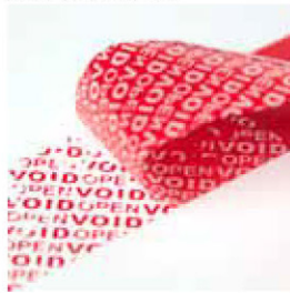
SK 81 - Partial transfer