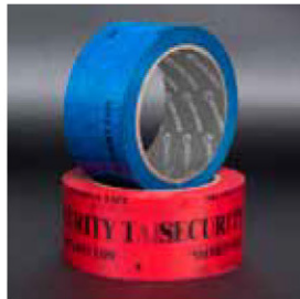
SK 76 / SK 77 - Total transfer